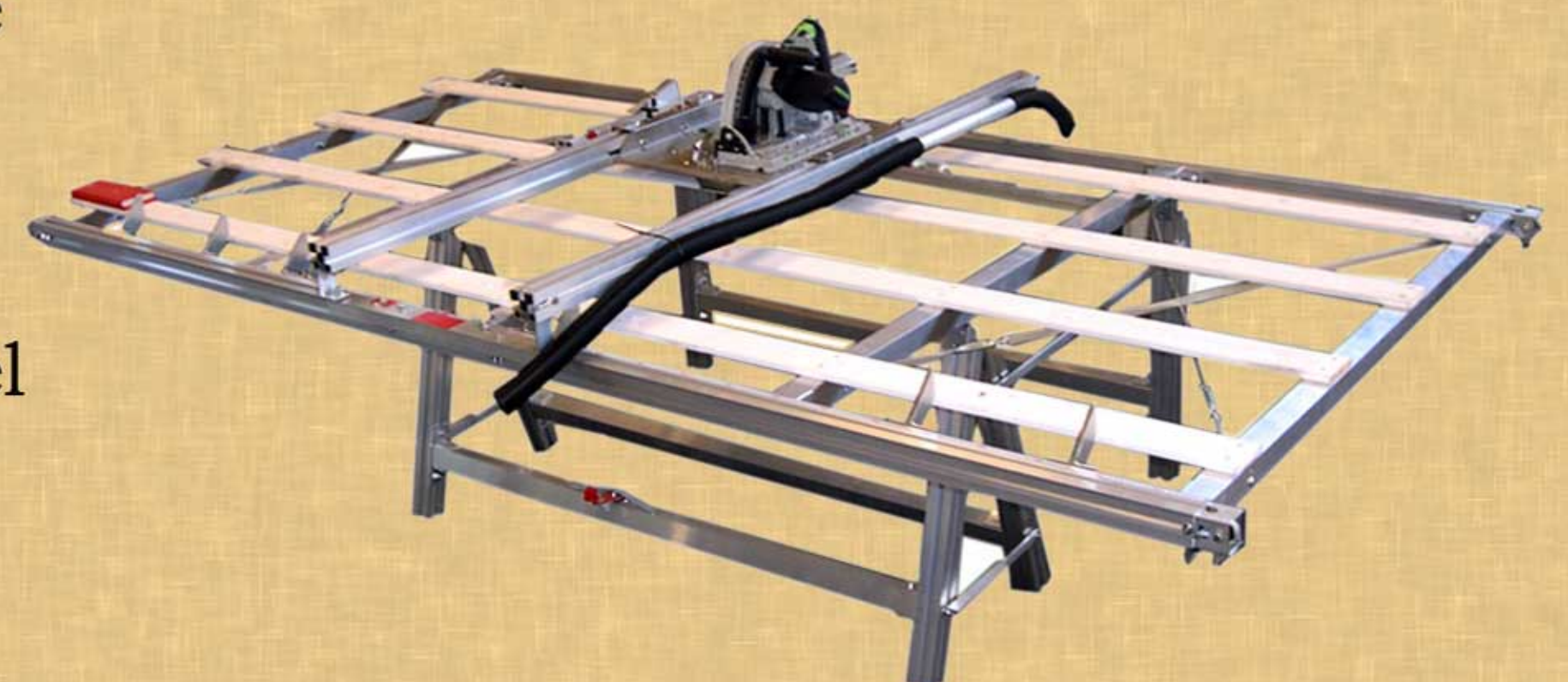
The BMI Panel Saw shown in horizontal position.

The tip function of the BMI panel saw puts an end to bad working positions. Furthermore the risk of injure from the saw itself is minimized due to the fact that you do not hold the board, but the saw.